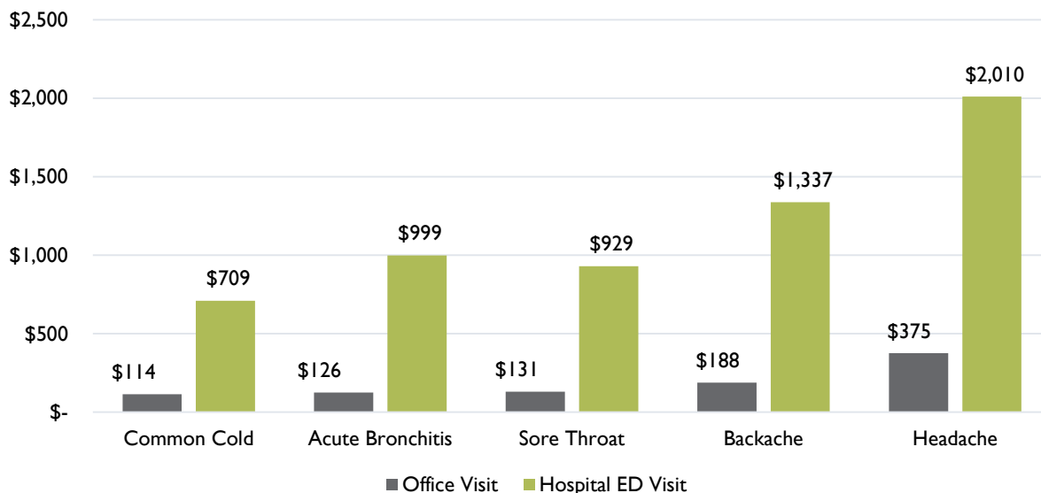
Figure II. Average Costs to Treat Common Ailments: Outpatient Setting vs. Emergency Department

2014 Commercial Payer Claims Analysis, Colorado All Payer Claims Database